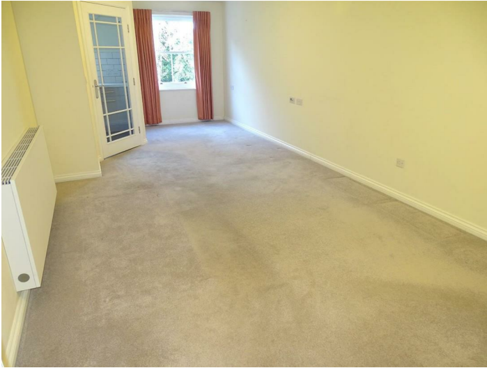
LOUNGE/DINER 24'6 x 10'8 maximum (7.47m x 3.25m maximum)

Electric heater, swan neck coving, sash window, glazed door to kitchen.