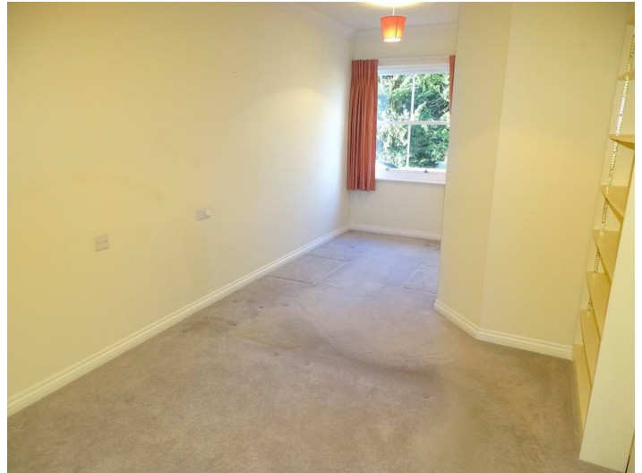
LARGE DOUBLE BEDROOM 19'4 x 9'1 maximum (5.89m x 2.77m maximum)

Electric heater, built in mirrored wardrobes, sash window, fitted shelving, swan neck coving, sash window.